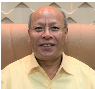
Shri. Prestone Tynsong

Hon'ble Deputy Chief Minister of Meghalaya i/c Animal Husbandry and Veterinary Department