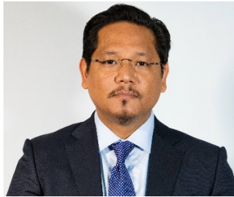
Shri. Conrad K. Sangma Hon'ble Chief Minister of Meghalaya

In order to improve the economic and nutritional status of the Meghalaya's population, our government has decided to launch a Rs. 209 Crore Piggery Mission implemented by the newly formed Meghalaya Livestock Enterprises Advancement Society (MLEADS).